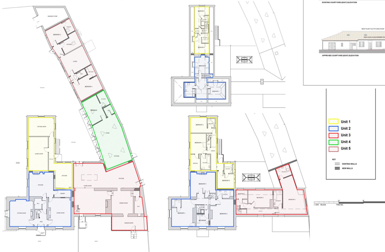
Worgret Manor - Proposed Floorplans with five units

Proposals include a pitch roof over the current bar and restaurant area, partitioned to create two cottage dwellings. The main Manor House lends itself to a range of configurations with a simple option to split the main T-plan building into two substantial townhouses included in the current planning application.