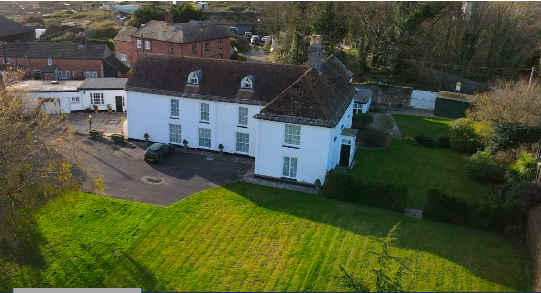
Worgret Manor Worgret Road Wareham BH20 6AB